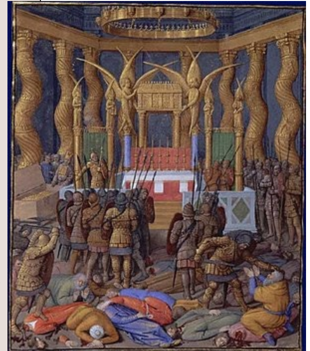
Roman General Pompey in the Temple

And the devout will prove their God’s judgment to be right when sinners are driven out from the presence of the righteous, those who please men, who deceitfully quote the Law.