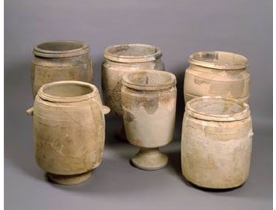
Jewish stone purification jars – Matt. 23:26, John 2:6