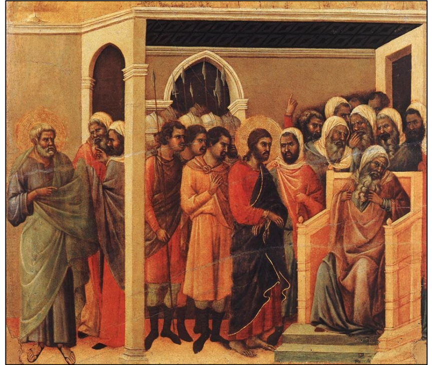
Christ Before Caiaphas, Duccio Buoninsegna