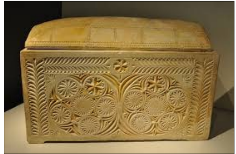
Caiaphas' ossuary (bone box)

How much responsibility do leaders have for society at large?